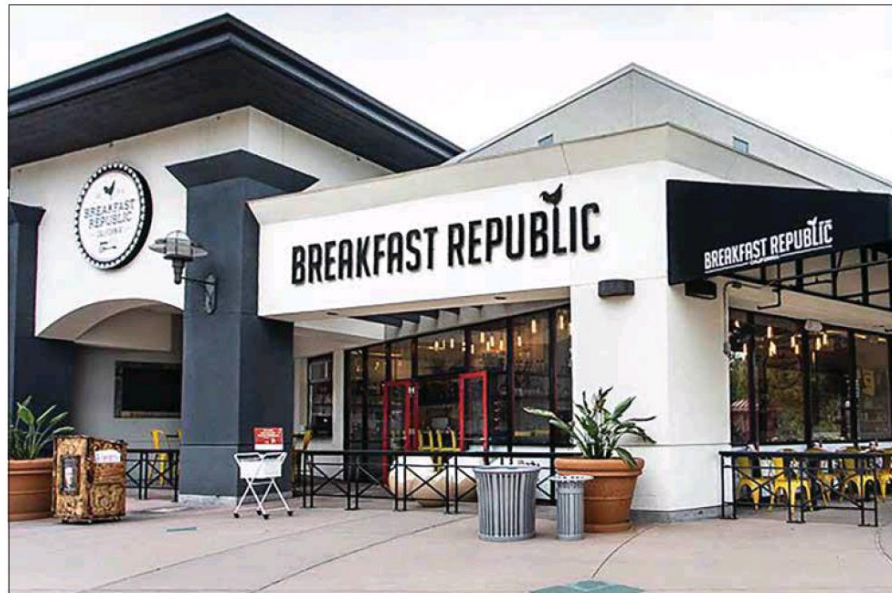
Rise & Shine Hospitality Group, founded in 2008, plans to open seven more restaurants in the near future.

Through his Rise & Shine nonprofit, which was established three years prior to the onset of COVID-19 last March, Engman funneled $79,290 and served a total of 8,983 meals to laid-off workers from impacted industries during the shutdown. Money accrued for the effort came primarily from the sale of breakfast burritos,