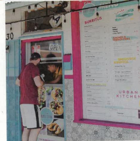
Clockwise from top left: University Avenue North Park sign, Original 40 Brewing Company, Max & Demetri's, Skin Habit, The Burrito Station, Verbatim Books